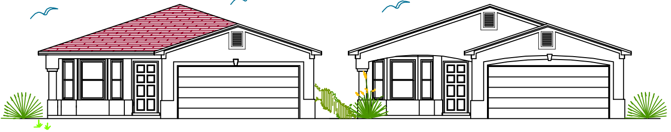
FRONT ELEVATION A