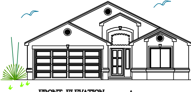
FRONT ELEVATION A